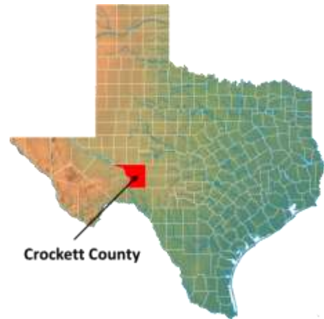
Table 1 reports private industry and employment for Crockett County in 2013. About 90 private industry establishments employed nearly 1,175 county residents at an average pay rate of $38,516. Private industry employees comprised approximately 60 percent of the county's 1,959 person labor force in 2013. 1

Historically, the county's economy depended on sheep and cattle ranching. Oil was discovered in Crockett County in 1925, supporting the ranching community. Hunting leases and tourism also support the economy.