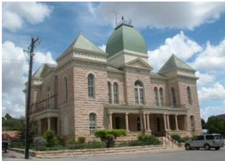
Crockett County Courthouse - Ozona, Texas

This report is part of a comprehensive project to assess the Health and Behavioral Health Needs of the Extremely Poor in a 20-county region of West Texas. The regional assessment includes Coke, Concho, Crockett, Edwards, Irion, Kimble, Kinney, Mason, McCulloch, Menard, Mills, Reagan, Runnels, San Saba, Schleicher, Sterling, Sutton, Tom Green, Upton, and Val Verde counties. The set of project documents includes a report for each county, plus a regional-level assessment.