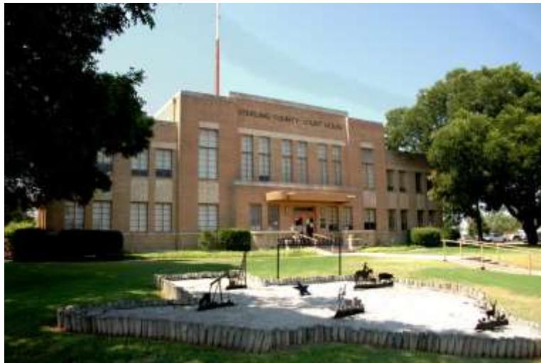
Sterling County Courthouse - Sterling City, Texas

This report is part of a comprehensive project to assess the Health and Behavioral Health Needs of vulnerable populations in a twenty-county region of West Texas. The region covers Coke, Concho, Crockett, Edwards, Irion, Kimble, Kinney, Mason, McCulloch, Menard, Mills, Reagan, Runnels, San Saba, Schleicher, Sterling, Sutton, Tom Green, Upton, and Val Verde counties. The set of project documents includes a report for each county and a comprehensive regional-level assessment.